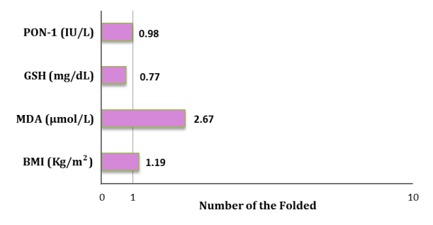
Fig. 1. The changes in the studied variables in hypothyroid patients versus controls.

<sup>a</sup> Values are set as mean (±SD) for continuous variable, T3 – tri-iodothyronine, T4 – tetra-iodothyronine, TSH – thyroid stimulating hormone, BMI – body mass index, MDA – malondialdehyde, GSH – glutathione, PON-1 – paraoxonase